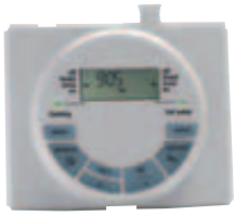
DT20 Twin channel digital programmer Part no. 7 716 192 038

The Greenstar Wiring Centre is compatible with the following Worcester plug-in controls: