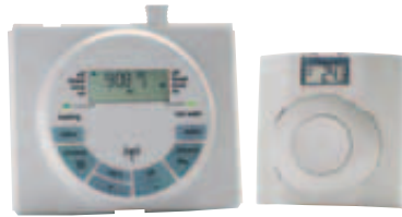
DT20RF Digital thermostat with twin channel digital programmer Part no. 7 716 192 054