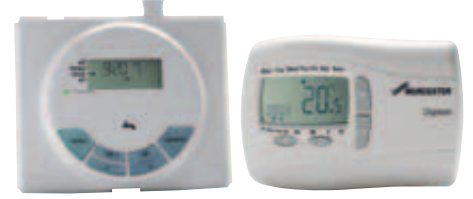
DT10RF Digistat Part no. 7 716 192 052