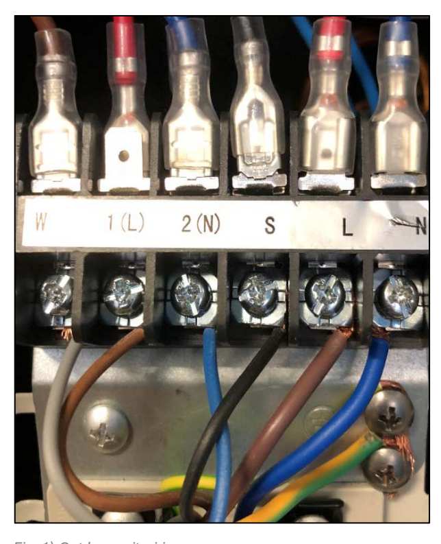
Fig. 1) Outdoor unit wiring

RAC 7kW unit: Nominal cross-section of cable = 2.5mm<sup>2</sup> Fuse rating of 25Amps.