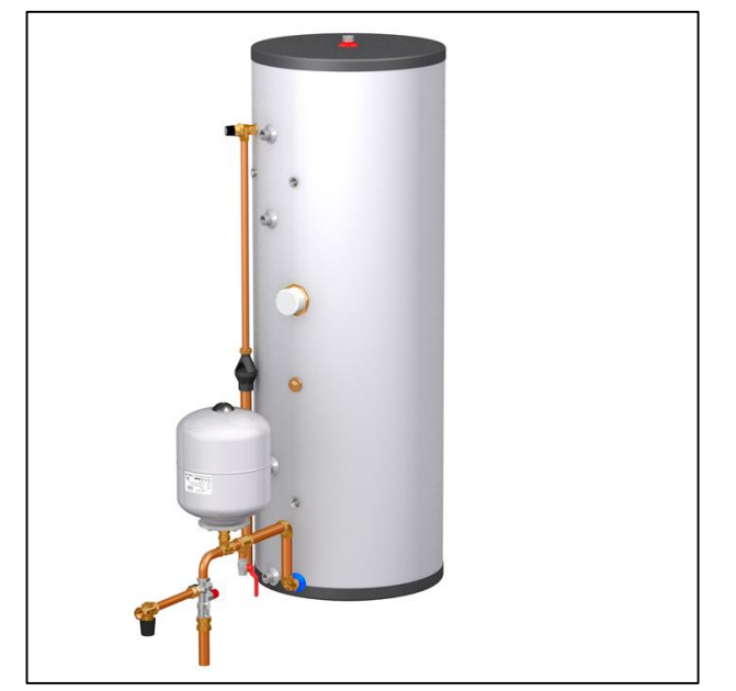
Fig. 1 Example Flamco unvented cylinder

It is for this reason that Bosch recommend that an anti-vacuum valve is always installed to prevent damage from incorrect drain down procedures.